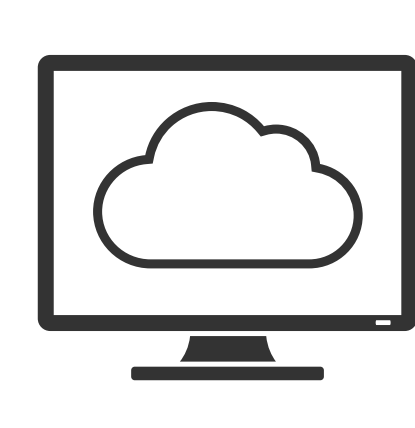
Deploy virtual desktops in hours